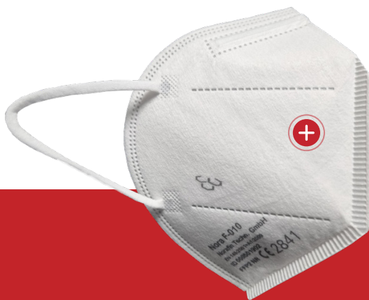
FFP2 certified Flat-Fold Respirator Mask Nora F with customized logo